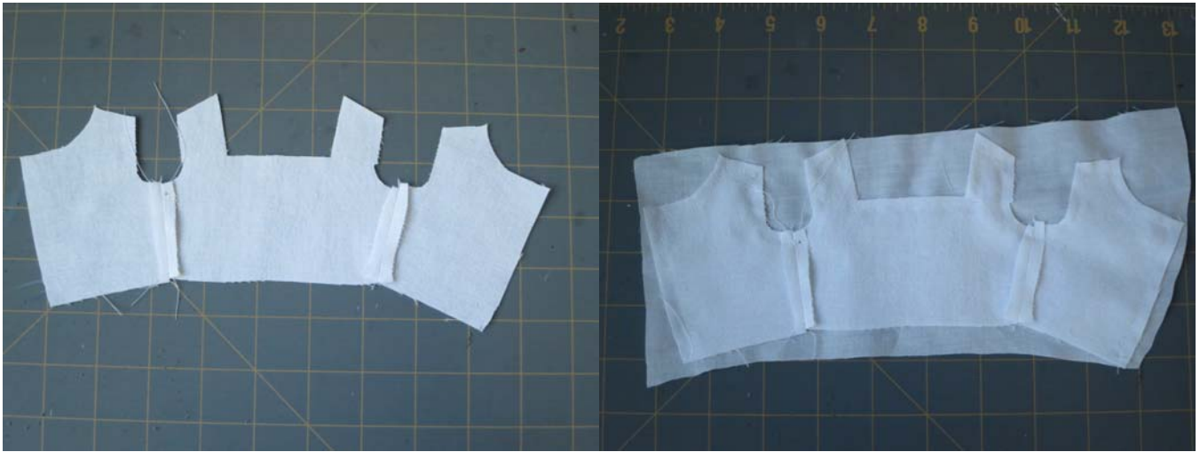
Lining for bodice can be self fabric if it's thin enough or use batiste