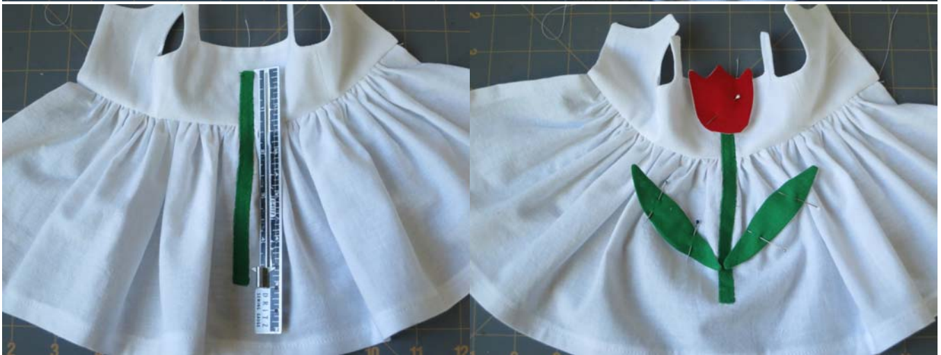
A ribbon or strip of trim would have worked better as a stem, but lacking any in the right color, you can use a 1" wide piece of leaf fabric turned under to about ¼" wide