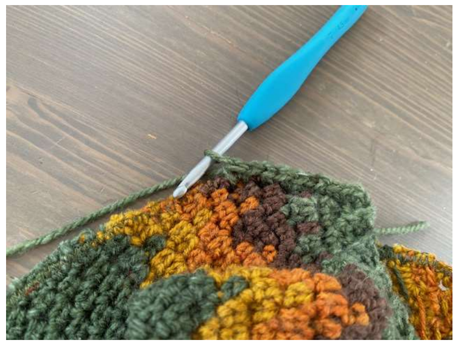
Pick up sts all down the back and do a row of sc.

I tried two methods and here's what I think: